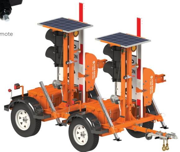
Nested Tow Position