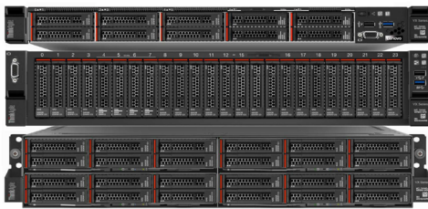
VX Series models above: VX3320 top, VX7520 middle and VX3720 bottom

Simplify IT infrastructure and accelerate time-to-value