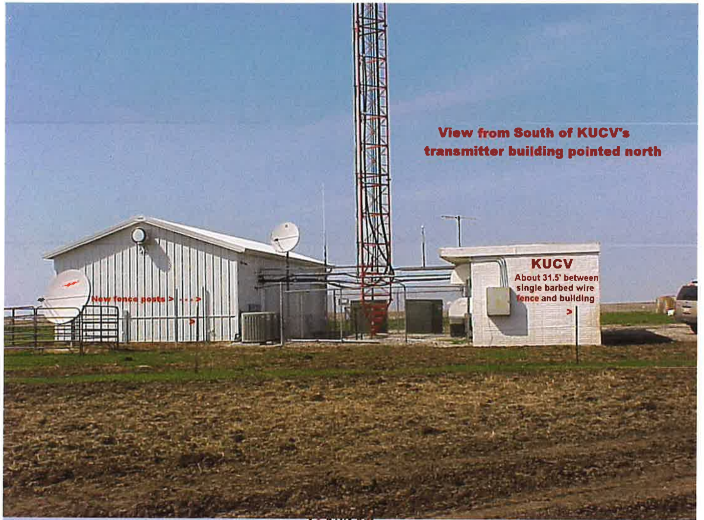
View from South of KUCV's transmitter building pointed north