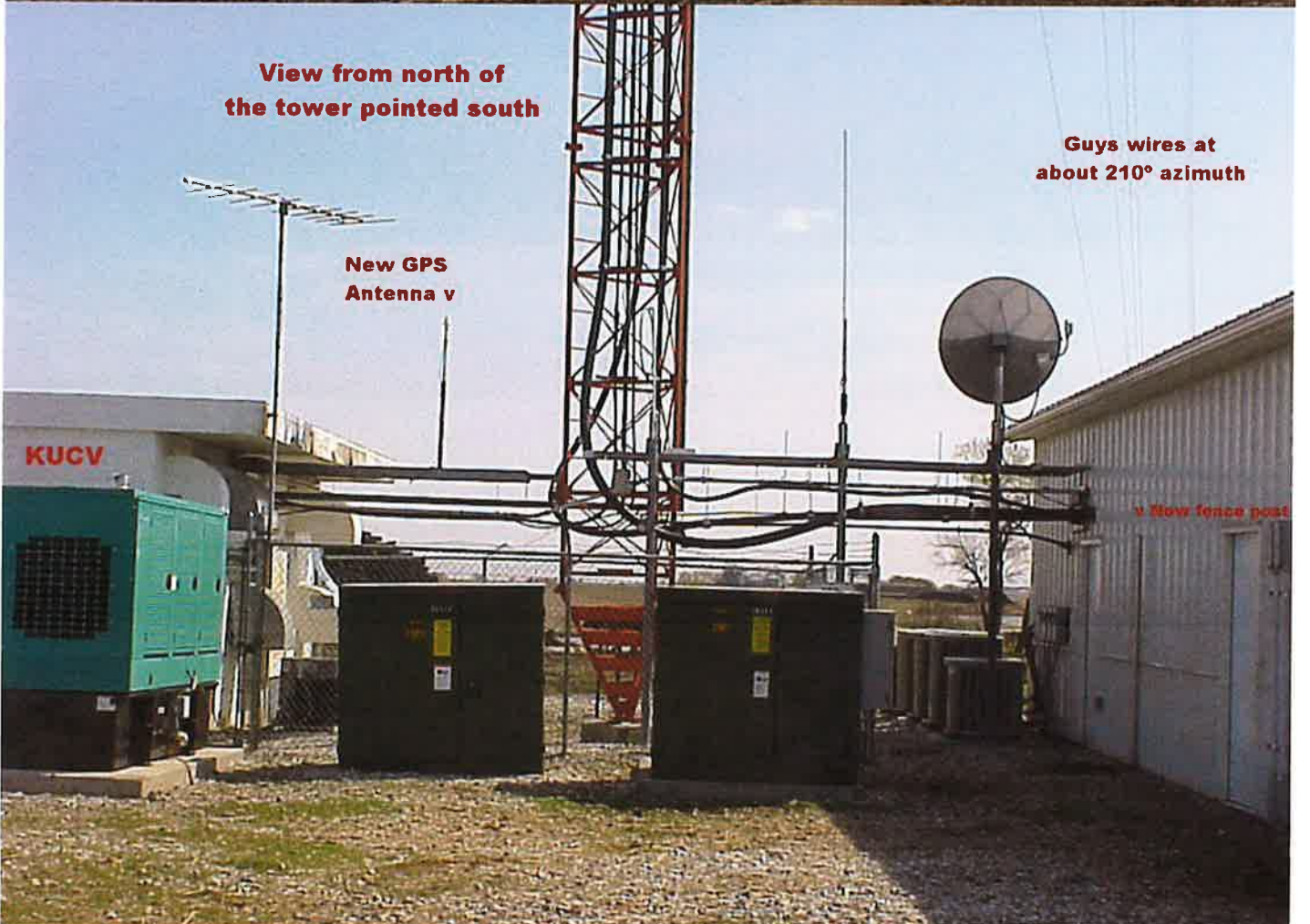
View from north of the tower pointed south

KUCV About 31.5' between single barbed wire fence and building >